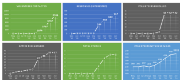
2 - ResearchMatch 12